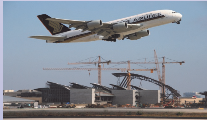
A Singapore A380 with the new International terminal under construction in the background.

the opposite direction. The APM will connect with Metro Rail Green line which will bring people in and out of LAX. The renewal and expansion of Los Angeles International Airport couldn't come at a better time. Passenger and cargo loads at LAX are back in the uptrend category having handled nearly 62 million passengers, 1.8 million tons of Air Cargo and over 80 tons in airmail in 2011 alone. Add that uptrend to the explosive growth of the Asia-Pacific region; which is projecting a 6.5% growth per year (compared to a 4% growth worldwide per year); and the Asia-Pacific region will be the