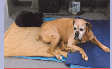
From Left to Right, Jet & Buster