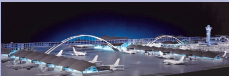
The new Air Bridge is seen above. Look closely and notice the left arch on the Air Bridge. That's an A380 under the air bridge. The A380 is the world's largest capacity passenger jet in use and its tail is nearly 79 feet high. That's the height of an 8 story tall building!

largest air travel market in the world by 2020. These combined factors will ensure that LAX will continue to play an increasingly key role in handling the passenger and cargo loads of the future in the global marketplace. For more on the LAneXt project visit www.la-next.com .