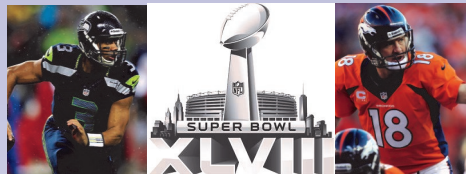
A Historic Meeting of Two #1 Seeds in SB XLVIII