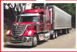
▶ DIESEL PRICES ...2