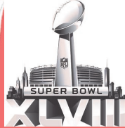
▶ THE COLD ONE ...2