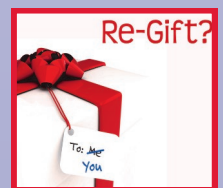
An Obvious Re-Gift