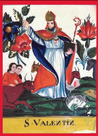
▶ VALENTINE HISTORY ...1