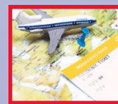
One -Way Ticket