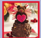
Coco Bear Jumbo