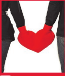
▶ THE WORST EVER ...1